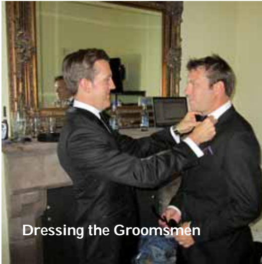
Dressing the Groomsmen