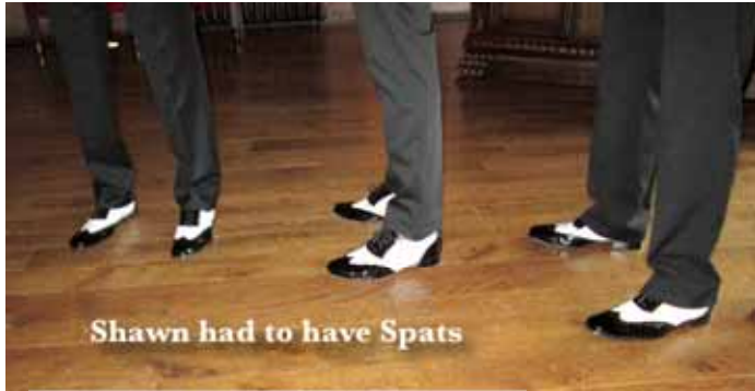
Shawn had to have Spats