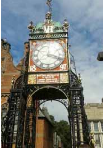
Fully working clock from 1897

Chester has the JP Polo Academy but when one has a Polo Field in one's own backyard we decided that the City Walls would be more interesting. Walking around an entire city on original Roman Walls has to be a pretty unique experience. It takes about an hour altogether and en - route you pass the beautiful pink sandstone cathedral, the River Dee, Chester Racecourse, the canal and enjoy views towards Wales and the Clwydian mountain range on the Welsh/ English border. It is easy to descend steps at various points to shop, pop into a pub or bar or visit a restaurant, which of course is what we did.