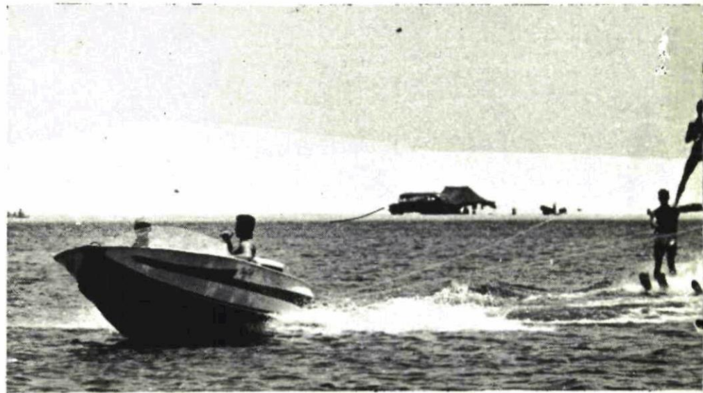
Water skiing enthusiasts provided thrills, skills, frills, spills and drills for the picnic pro