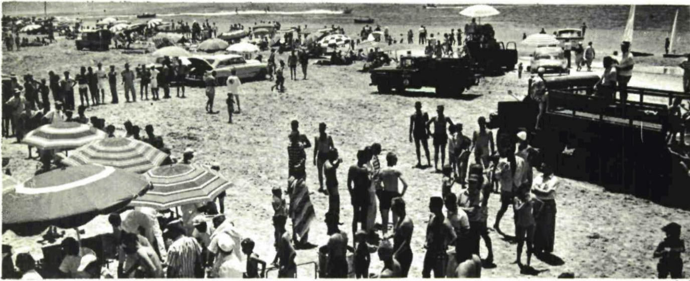
One of the largest crowds ever to participate in an AEA function turned out for the Half Moon Yacht Association-AEA picnic at Half Moon Bay, where they frolicked on land....