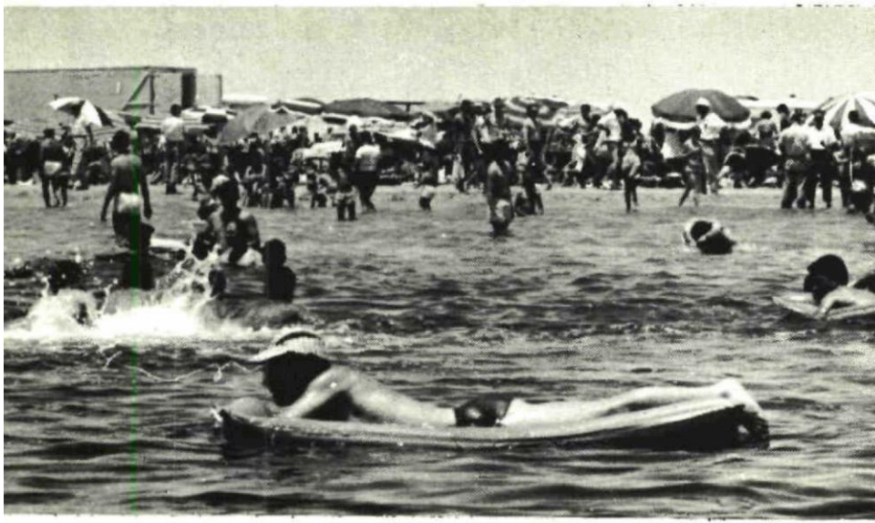
.... on the sea ....