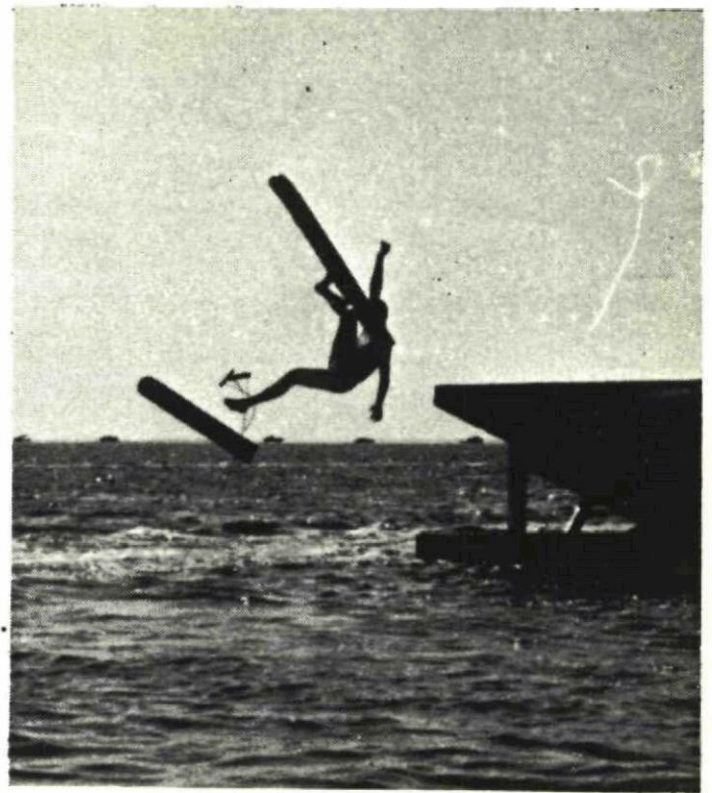
.... and in the air ....