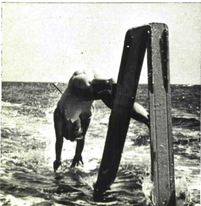
Bev Eilbacher takes one of the spills.